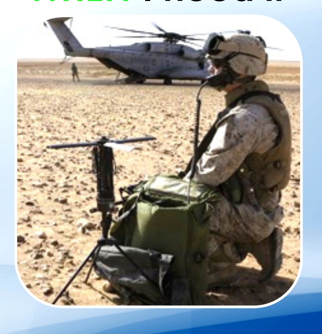
WHEN I need it